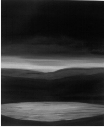
Fig. 4 Felicity West. West Coast . 2000

their ideas. In retrospect, this aim was not properly thought through. As we discovered, for good reason, the urge to compose took precedence over the plan to notate. In the final analysis, the notational symbol system proved redundant, since the students had little difficulty remembering their pieces, which they continued to refine, right up to the point of recording them.