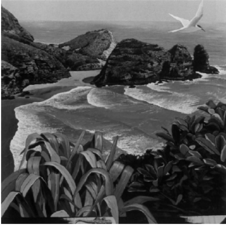
Fig. 2 Russell Jackson. South Piha . 1992

appealed to them. The following paintings were chosen: